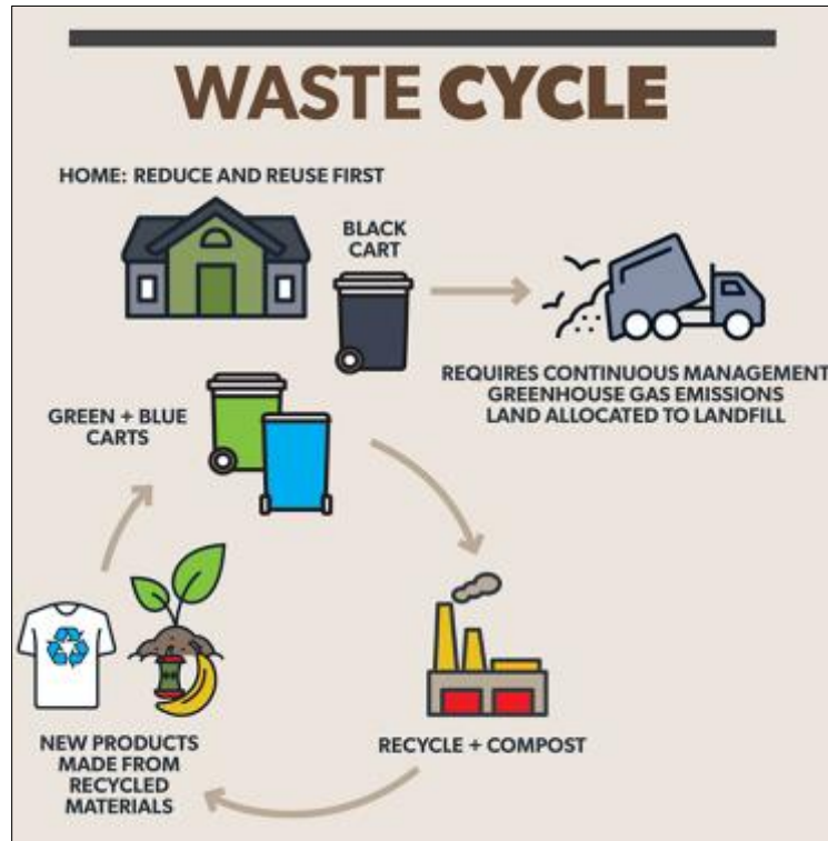
Figure 2 Waste cycle

The coming step after drawing and drying is the manufacture of the final product. As per the vacuity of the raw Paraphernalia the final product is made. numerous products are manufactured with waste products which include paper, soft drink holders, glass, sword barrels, plastic holders, laundry cleansers, paper bags, plastic glass and other disposables. 6. Quilting and dealing This is the last and the final step in the process of recycling of products. The products manufactured are duly packed with markers and canons. This is also transported to the dealer which reaches the requests for noncommercial and retail trade.