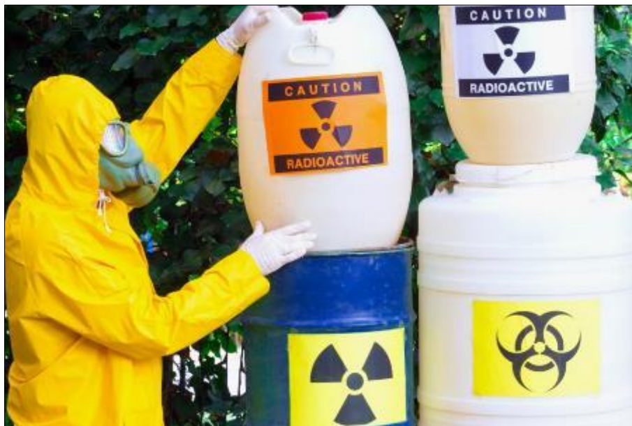
Figure 1 Hazardous – waste management