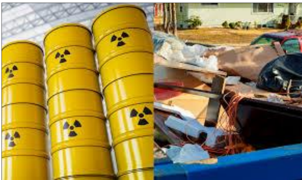
Figure 6 Hazardous and non-hazardous