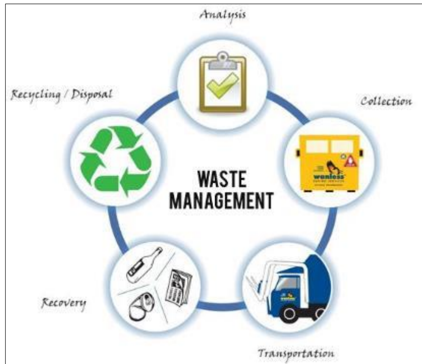
Figure 3 Recycling process