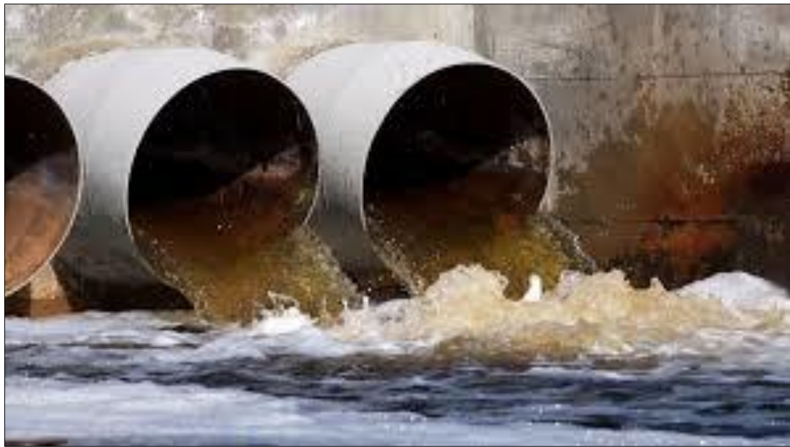
Figure 5 Waste Water

It is the final cleaning process that improves waste water quality before it is reused, re-cycled or discharge to the environment. Example: by alum, chlorine, etc . It is also used to further reduce parameter value below the standards set out in national